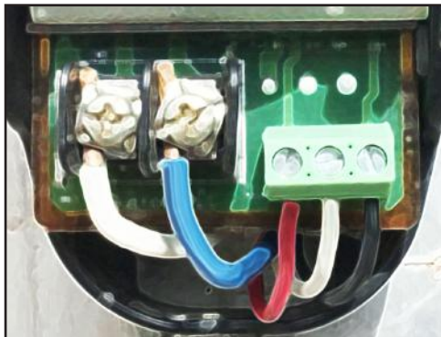
Ped Call Wires/Terminal on Left. 3-Position Terminal Block on right (for operating as iN3)