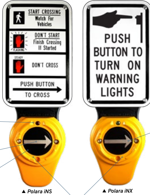
▲ Polara iNS